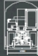
Storage Dimensions (mm)